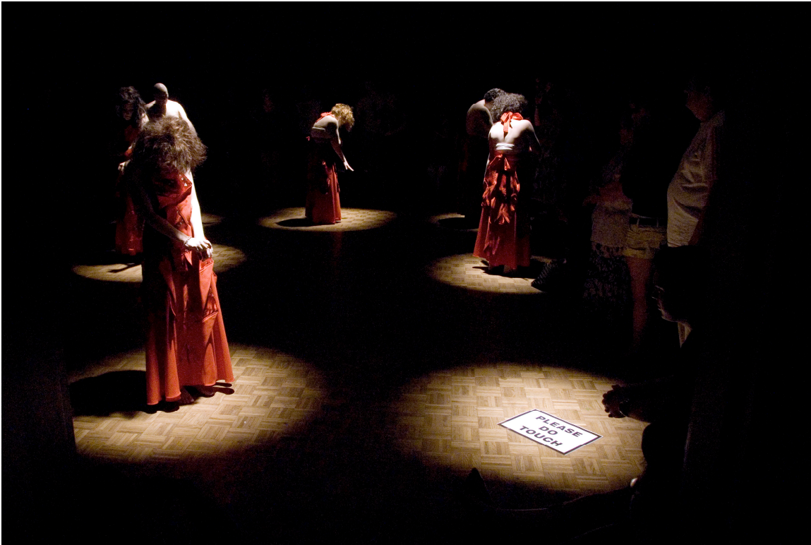
Six Billion Love at National Multicultural Fringe 2009